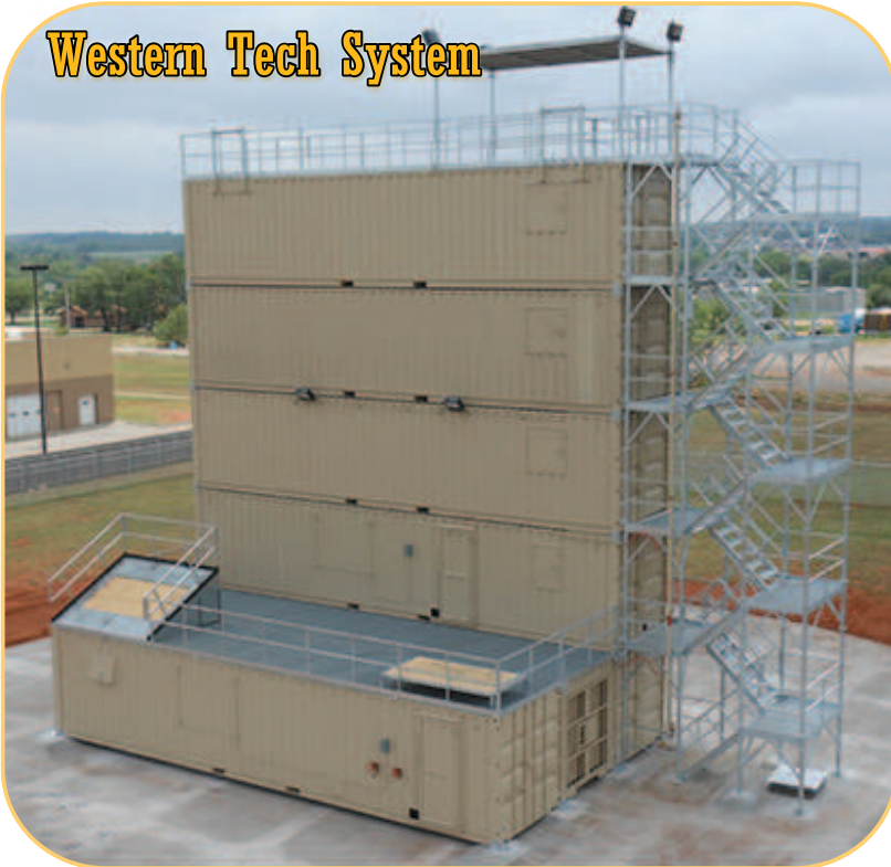
Western Tech System